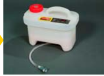
Q966 – PULSE™ CADDY